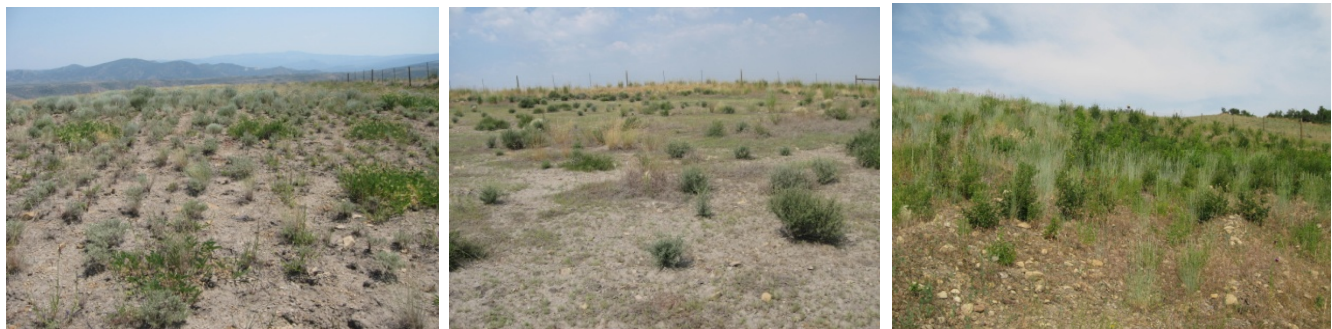
Figure 4. Various non-topsoiled plots at Colowyo (left), Trapper (middle) and Seneca (right) mines in July 2007 showing differing shrub establishment success.

Results from the demonstration plots illustrate the complex interactions of various cultural and environmental factors in the establishment of woody vegetation on reclaimed surface mines. Shrub establishment and seeding success has been variable across the three mine sites (Figure 4, Tables 6-11) likely owing to timing of the seeding, spoil quality and variable local climatic conditions at the three sites after seeding.