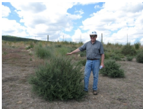
Figure 5. Robust bitterbrush shrubs such as this one are abundant inside the fenced portion of plot 5, but not outside the fence at the Trapper mine demonstration plots. Photo taken in July 2008.

Despite the poor initial (2001-2004) establishment of shrubs and the dominance of weeds at the Trapper site, there was modest establishment of some shrub species at Trapper by 2007, especially within the fenced portion of the plots (Figure 5). The lack of substantial shrub cover outside the fence (Table 9) despite the presence of some individual shrubs as indicated in Table 8, might be due to the small stature of these browsed shrubs and the dominance of weeds in the unfenced portion of the plots. .