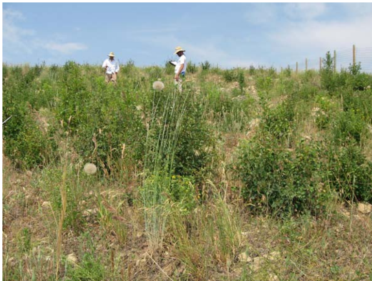
Figure 7. Robust serviceberry transplants inside the fenced area at Seneca Mine in 2007.

*Seeded in alternate rows. † SM = Surface manipulation, TP = transplants.