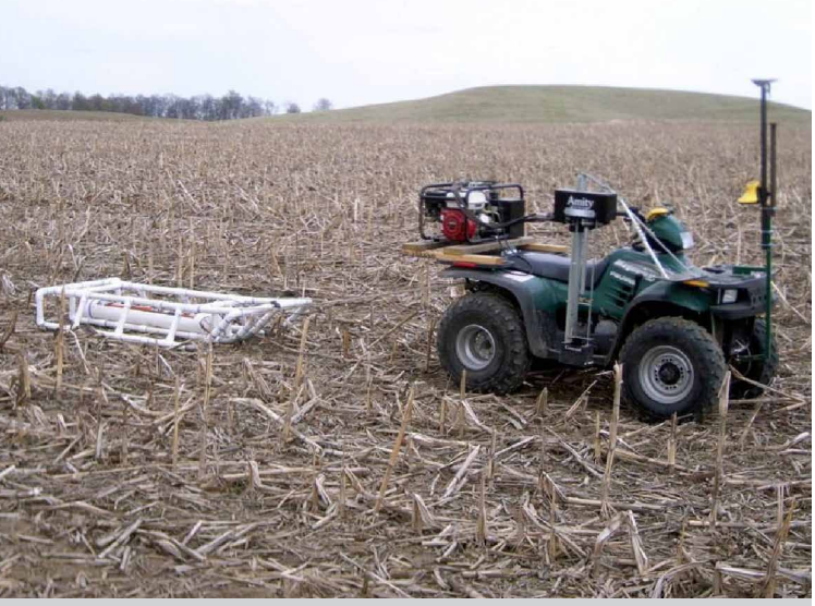
ABOVE PHOTO: Collection of terrain and electrical conductivity measurements at the Lewis Mine site in Indiana.

Time required for productivity validation with yield tests over time may be ten times that required for extraction and reclamation. A soil based method of productivity validation will provide the shortest period of time that the land will be out of normal production. Today, after 30 years of reclamation research, the idea of a soils based productivity model for bond release could be a reality because of the large database on yield response to minesoil reclamation and new technology to accurately measure soil parameters on a spatial scale. This would result in reduced time and effort from all involved while not compromising the accuracy of productivity testing.