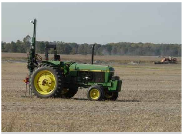
ABOVE PHOTO: Collection of cone penetrometer test measurements at the Lewis Mine site in Indiana.

Successful soil-based models have been developed that adequately predict bond release. Compaction and water related variables are important in describing yield variation across years. We believe our soilbased modeling approach has clear benefits over the current yield-based system, thus we propose modeling soil variability as a diagnostic tool to identify problematic field areas and to complement yieldbased requirements.