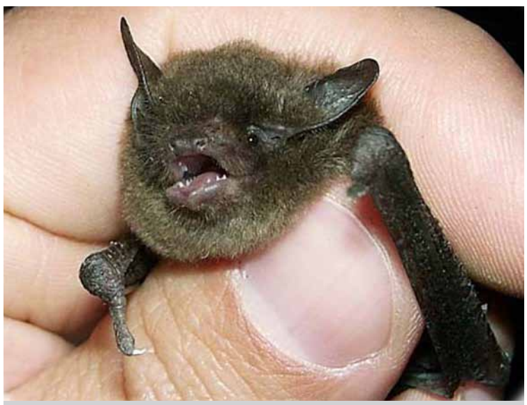
ABOVE PHOTO: Indiana Bat (Myotis sodalis).

Future studies may include multi-temporal approaches (within the same year or between two different years) to satellite data acquisition as an effort to increase accurate separation of land cover, expansion of the study area, a more specific aerial image acquisition process to only capture data over forested areas, and ground surveys to test the results obtained from RS data analyses.