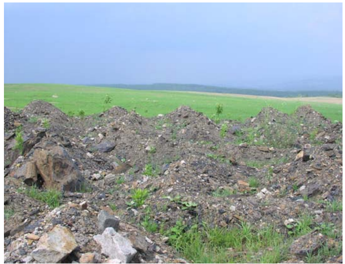
This photo shows the loose soil on the surface of the mine. Tree seedlings have been planted.