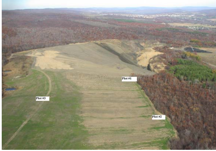
Three areas of Savage Mountain demonstrate the Forestry Reclamation Approach .

These photos show the Forestry Reclamation Approach being implemented at an Amerikohl mine site in Pennsylvania.