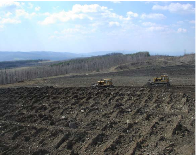
D-9 bulldozers pushed soil from the stockpile area and deposited it on the surface of the demonstration plots. The bulldozers then pushed a blade full of soil to the back of the demonstration plots, butting each against the previous. In this manner, the topsoil was never compacted by bulldozer traffic.

The initial results appear to show greater tree growth and survival rates on the FRA sites, although a late summer drought in 2005 has affected the results on Plot #1. It will require at least one or two more growing season before the benefits can be visually observed.