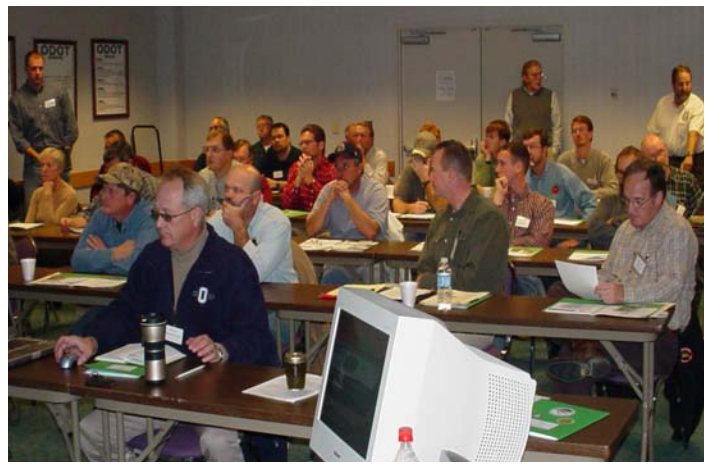
Attendees listened to a presentation about ARRI and FRA at the New Philadelphia, Ohio workshop.

workshops were the first of many planned for in Appalachia discussing ARRI and the use of FRA.