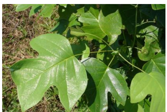
(Left) Yellow-poplar seedling on Gatliff Coal Company mine site.

A. Williams Forestry & Associates has been in business for over 33 years and is the leader in reforestation of mine lands with over 39 million trees planted on reclaimed surface areas. Williams Forestry & Associates' Native Forest Nursery specializes in growing native hardwood seedlings used for mine reclamation in the Appalachian Region. Our company has been an active proponent of loose grading, reduced ground cover, and the planting of high value hardwoods for over 16 years. The Office of Surface Mining and the Forestry Reclamation Approach has greatly assisted the efforts of promoting the creation of forestry sites that will one day be productive and diverse forests. It is the goal of Williams Forestry and Associates to partner with Coal Operators and ARRI to promote the restoration of mined lands.