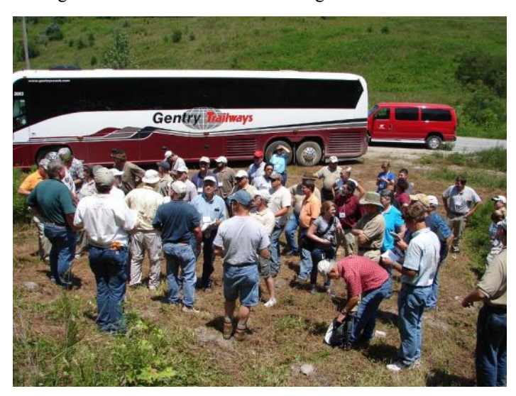
The ARRI conference tour moved through the mine sites by bus, stopping at several places along the way. Tour participants listened to speakers describe the reclamation they saw.