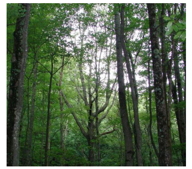
The forest depicted in these top three photos is a preSMCRA mine site planted in uncompacted soil in 1959. The tree species used in planting were black locust and pine species, although many other species are now present. The ARRI conference members enjoyed hearing about the history of this mine site and took a walk through the forest to view the tree species