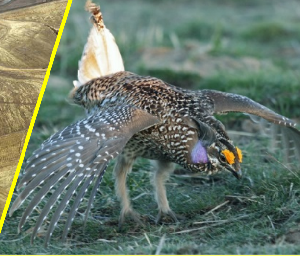
Columbian Sharp Tailed Grouse