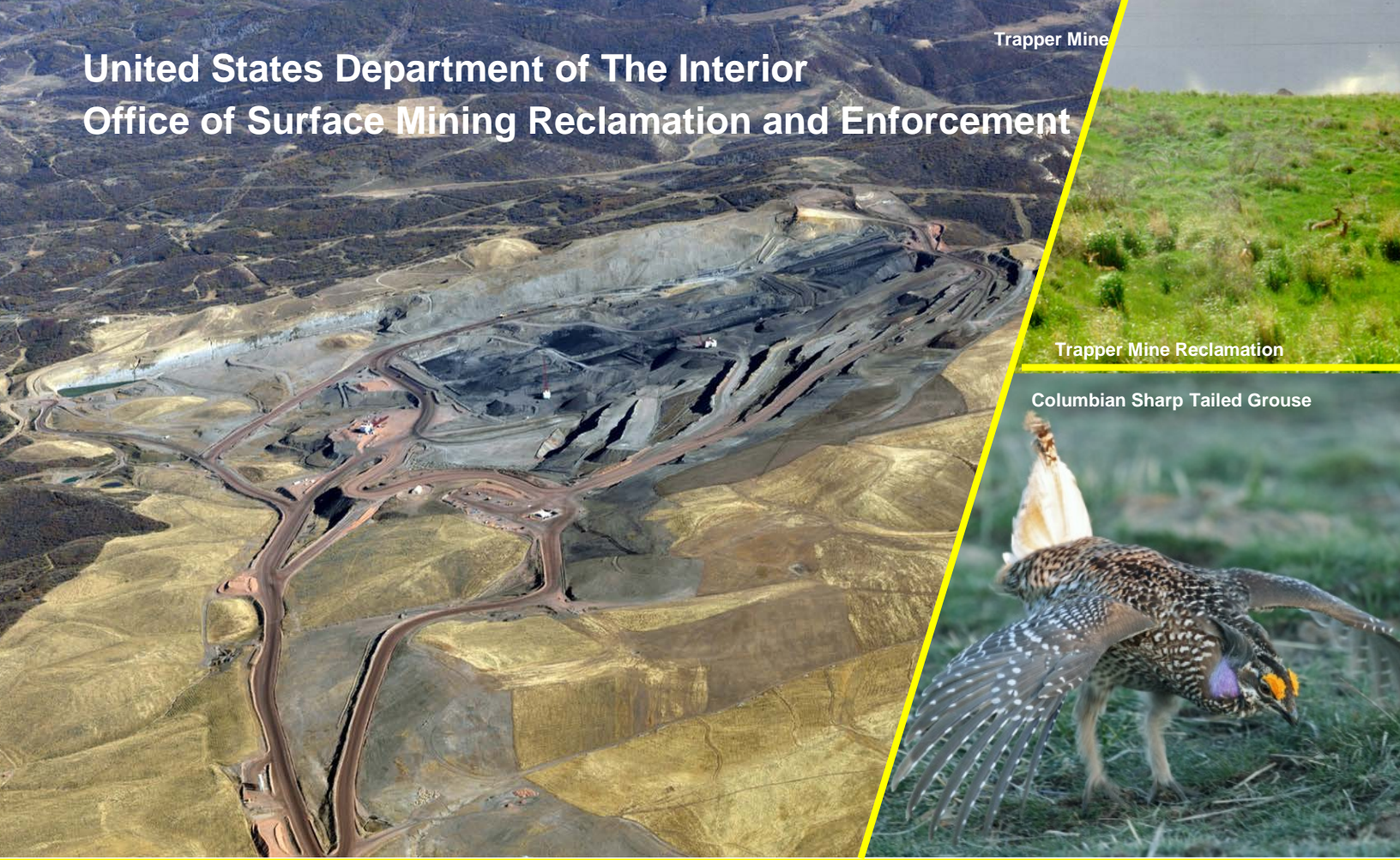
Trapper Mine Reclamation