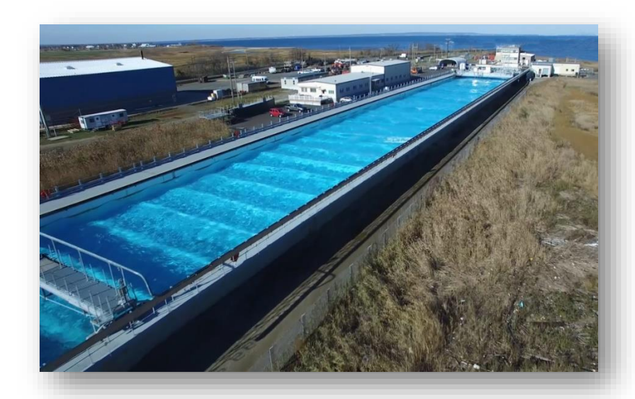
Managed by U.S. Department of Interior's Bureau of Safety and Environmental Enforcement (BSEE) and operated through a contract with Applied Research Associates, Inc. since September 2018